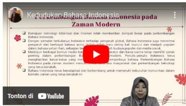
Figure 3. Display of learning video

The way to utilize slides is by reading it directly or downloading it first. It can be viewed in figure 4.