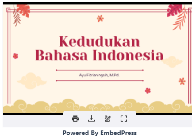
Figure 4. Display of slide media

The way to utilize slides is by reading it directly or downloading it first. It can be viewed in figure 4.