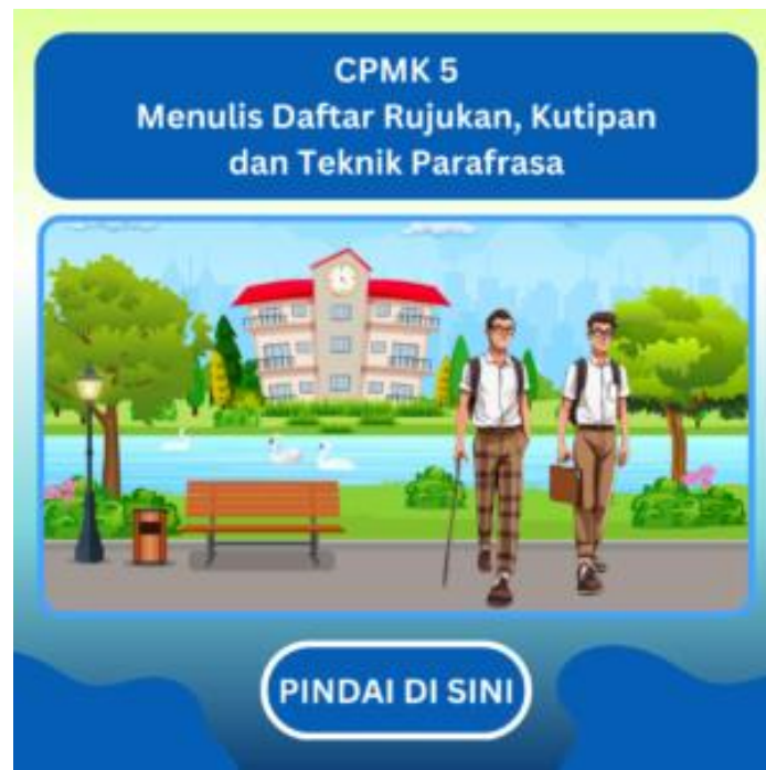
Figure 6. Display of Augmented Reality

The way to utilize Augmented Reality is by downloading scanner application to scan the barcode as stated in instructions for use. After that, the camera has to be directed into Augmented Reality in each learning outcome. It can be viewed in figure 6.