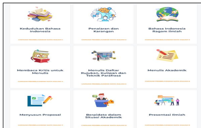
Figure 1. List of Learning Materials

As a provider of learning materials, the website of Indonesian learning material contains 9 materials. They are 1) kedudukan bahasa Indonesia , 2) penalaran dan karangan , 3) bahasa Indonesia ragam ilmiah , 4) membaca kritis untuk menulis , 5) menulis daftar rujukan, kutipan, dan teknik parafrasa , 6) menulis akademik , 7) menyusun proposal , 8) berpidato dalam situasi akademik , and 9) presentasi ilmiah . To access the material, the students have to click the title in the main menu of website as viewed in figure 1.